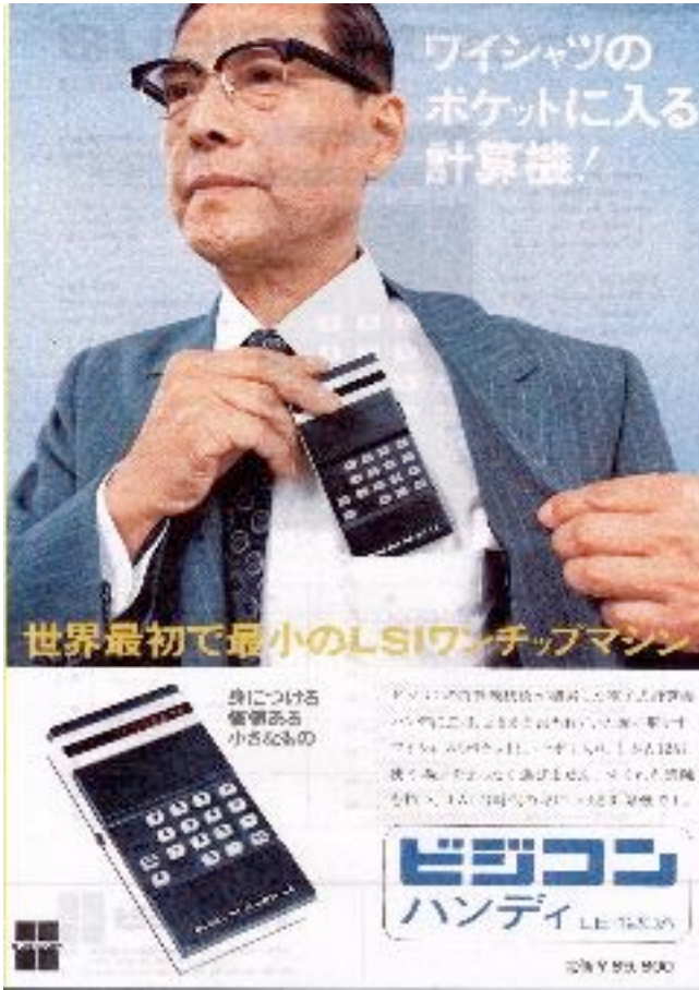
The time of sale Designs differ a little.